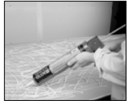
Figure 3.1: Apply Green Glue to the backside of second layer of drywall

Disclaimer: These application notes represent the accepted procedures for successful installation of Green Glue. These suggestions may be followed, modified, or rejected by the owner, engineer, contractor, and/or their respective representative(s) since they, not Sound Isolation Company, are responsible for planning and executing procedures appropriate to a specific application. Sound Isolation Company reserves the right to alter these suggestions and encourages contact with the factory or its representatives to review any possible modification to these application notes prior to commencing installation. It is the responsibility of the owner, engineer, contractor, and/or their respective representative(s) to ensure that installation meets all applicable Building Codes. There is no performance warranty expressed or implied for any particular project or installation.