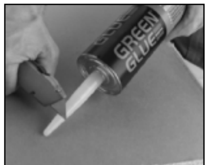
Figure 2.3: Cut a 3/8" opening in tube