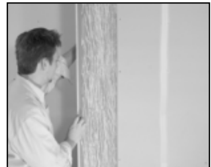
Figure 3.3: Apply second layer of drywall