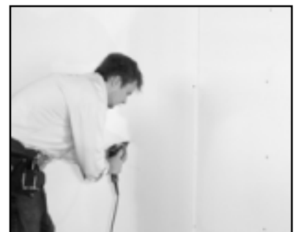
Figure 3.4: Secure second layer into place