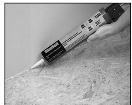
Figure 2.2: Use acoustical caulk along perimeter.