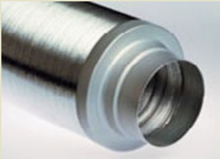
Privacy Duct Silencer