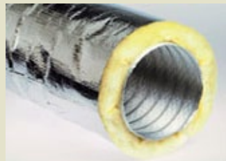
Privacy Replacement Duct